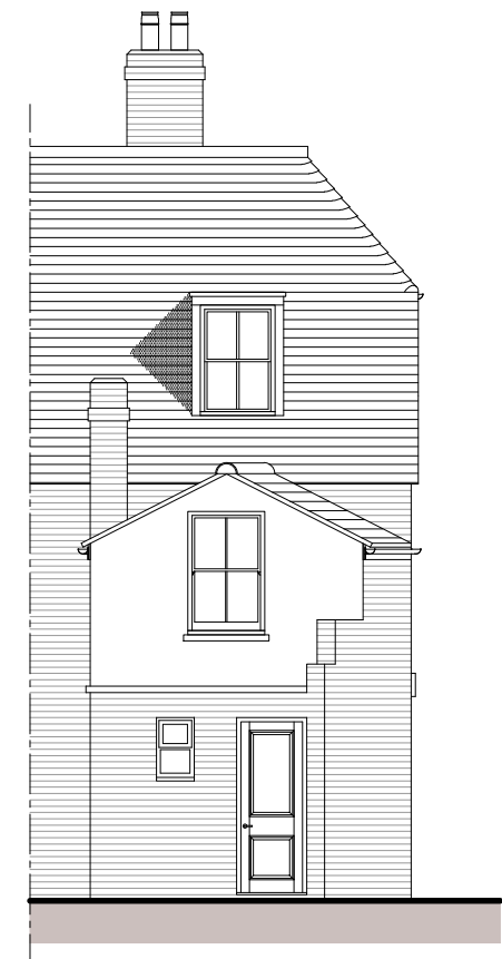
SOUTH ELEVATION PROPOSED

project PROPOSED TEA ROOM AND FLAT BOSUNS STORE 9 HIGH STREET QUEENBOROUGH SHEPPEY KENT ME11 5AA