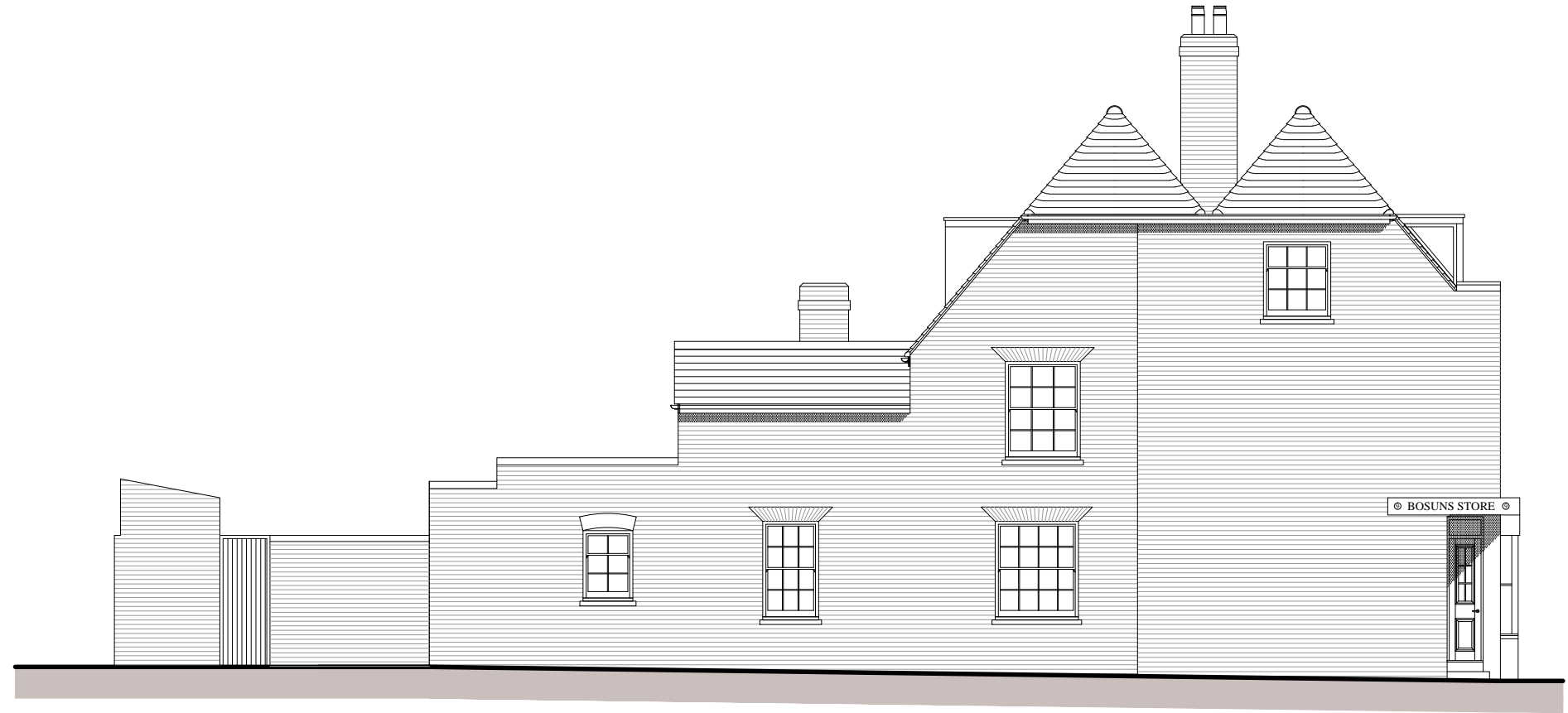
EAST ELEVATION PROPOSED