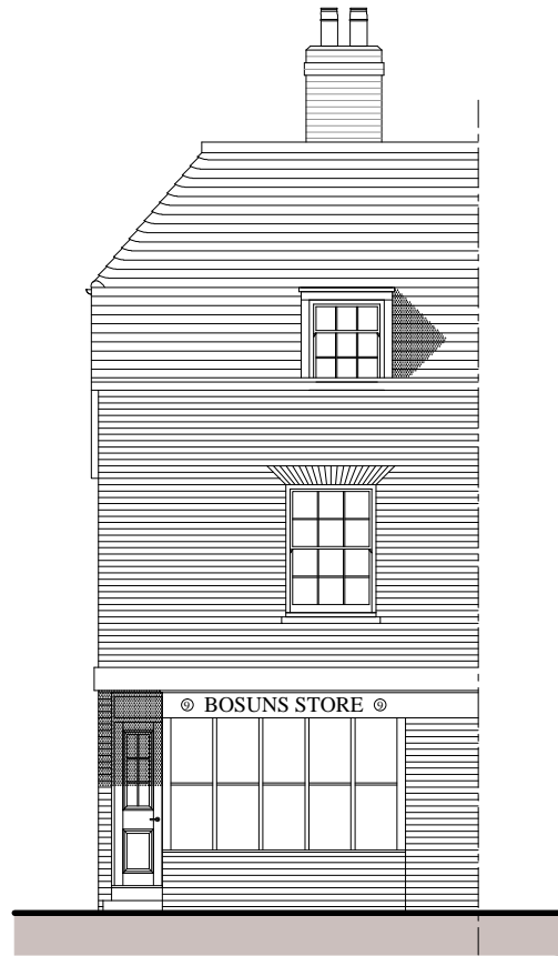
NORTH ELEVATION PROPOSED

1.0m 2.0m 3.0m 4.0m 5.0m 6.0m 7.0m 8.0m 9.0m 10.0m